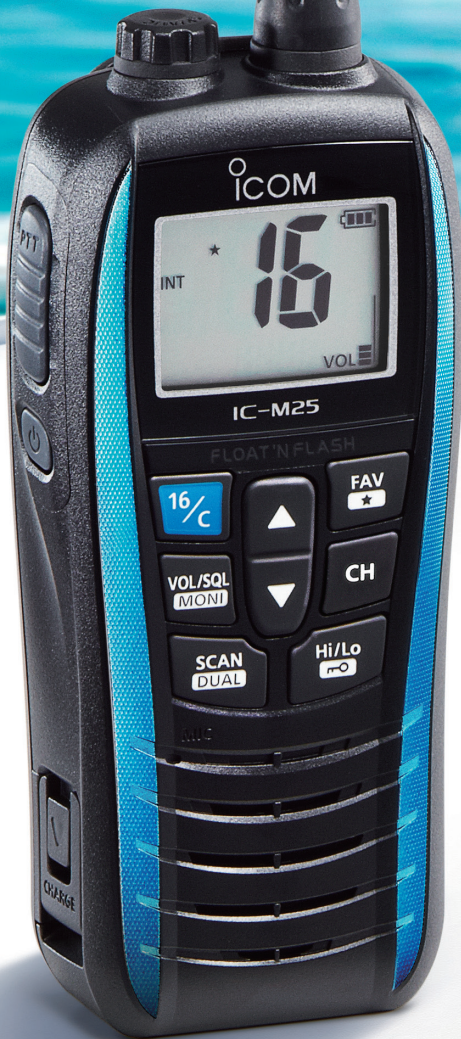
● Marine Blue